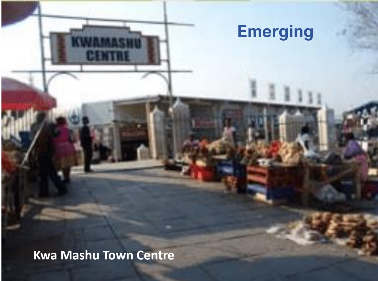
Kwa Mashu Town Centre